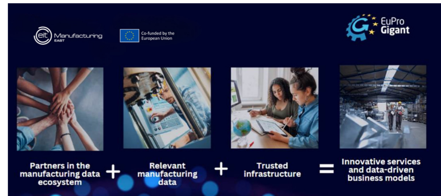
Figure 2: Data sharing success factors; Source: EIT Manufacturing East GmbH©